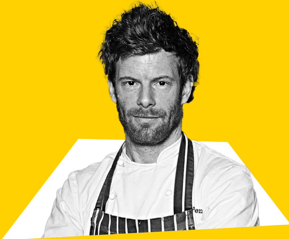
Our Patron Tom Aikens Highly Acclaimed British Chef

Our Ambassadors volunteer their time to help us spread the word about Only A Pavement Away and raise vital funds. For that we are incredibly grateful.