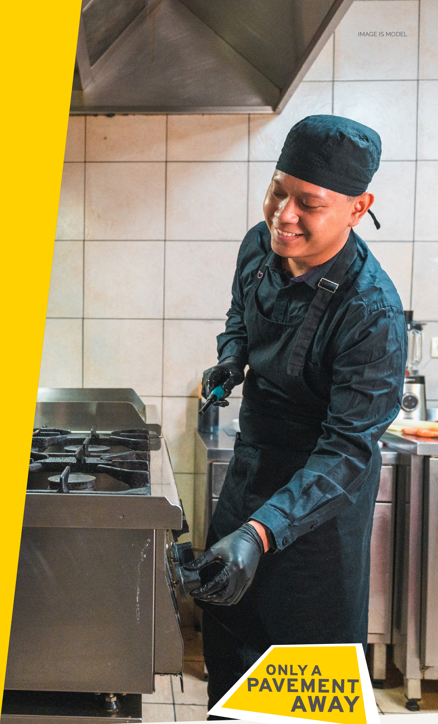
IMAGE IS MODEL

For the prisons, these visits are extremely valuable as they enable the institutions the option to offer their candidates employment-based training at no extra cost.